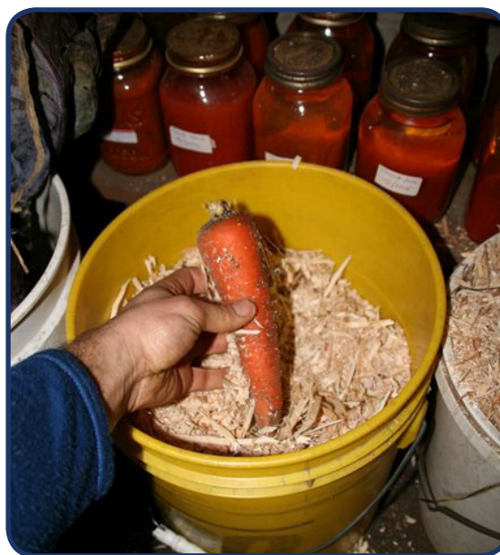
Richard stores carrots in sawdust

Nut trees, berry bushes and fruit trees might also fit into your homestead permaculture landscape. Black walnuts, butternuts and hazelnuts grow well in Vermont and store for years in a cool dry attic. Strawberries, blackberries, raspberries and blueberries are all proven producers in our northern climate and can be turned into jams or dried.